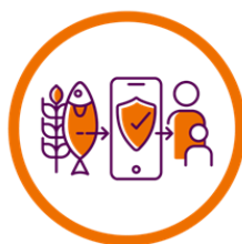
REDUCING RISK FOR A FAIR & RESILIENT FOOD SYSTEM

Grow the circular food economy through packaging & labelling