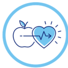
HEALTHIER LIVES THROUGH FOOD