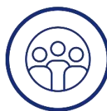
COMMUNITY & COALITIONS