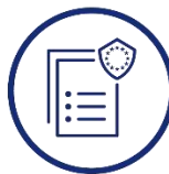
POLICY AND REGULATION