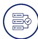
DATA, DEFINITIONS & STANDARDS