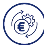
FINANCING FOR CHANGE