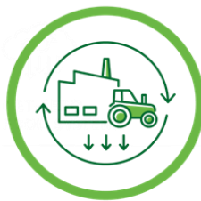
A NET ZERO FOOD SYSTEM